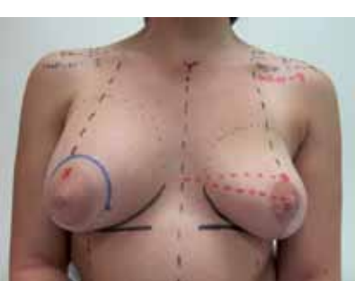
Planning for stage 2 of surgery – right breast: exchange for final definitive breast implant after tissue expansion plus concurrent breast lift and nipple-reshaping surgery; left breast: augmentation of previously lifted breast from stage 1 of surgery