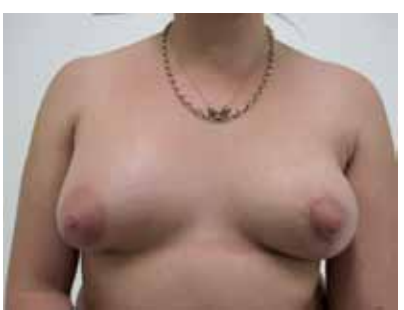
AFTER stage 1 of surgery - restoration of breast volume symmetry