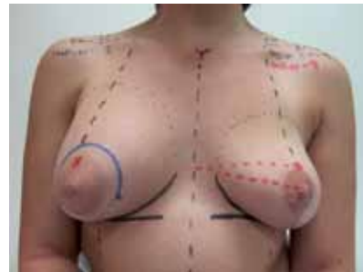
Planning for stage 2 of surgery – right breast: exchange for final definitive breast implant after tissue expansion plus concurrent breast lift and nipple-resaping surgery; left breast: augmentation of previously lifted breast from stage 1 of surgery