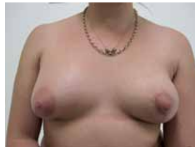
AFTER stage 1 of surgery – restoration of breast volume symmetry