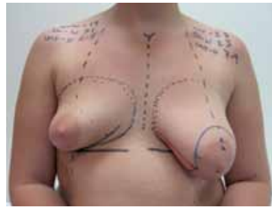
Planning for stage 1 of surgery – right breast: tissue expansion for definitive implant placement; left breast: lift procedure in preparing ideal breast shape for stage 2 augmentation